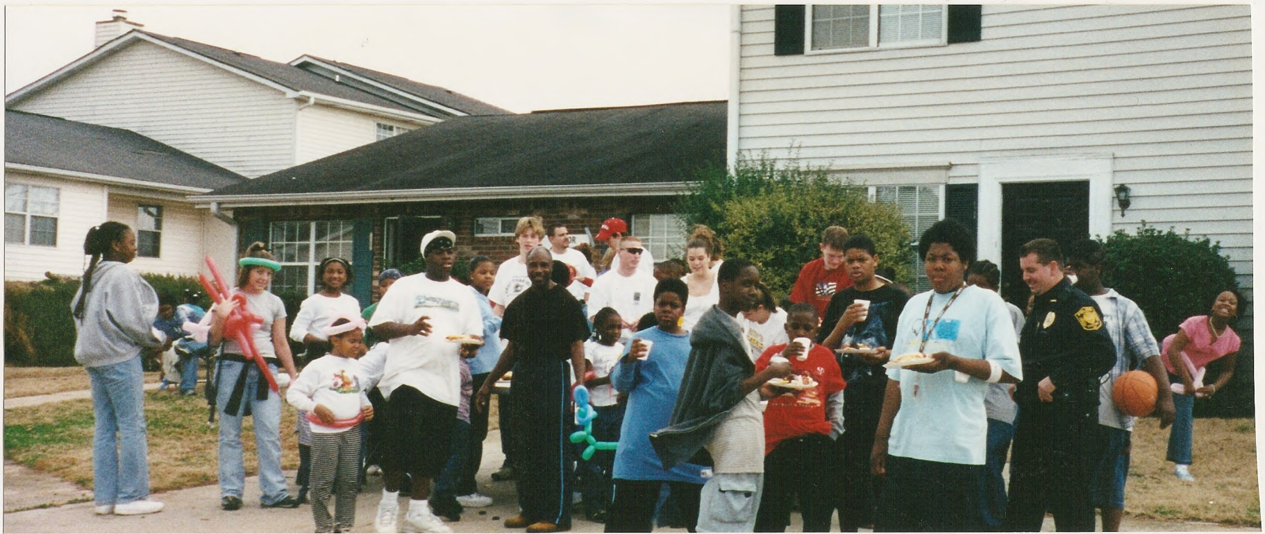
Outreach Event at our new Mission in Conyers, Georgia